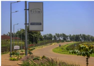
Completed Phase I infrastructure