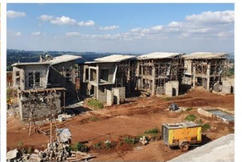
Ongoing construction of Tilisi Views

Fully serviced land parcels from 1 acre available for logistics, commercial, residential, education, medical & recreation