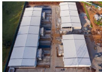
Africa Logistics Properties on track for opening this October