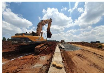
Phase II construction ongoing