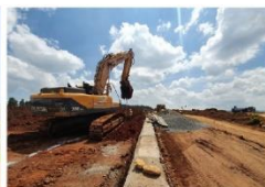
Phase II construction ongoing