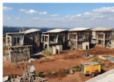
Ongoing construction of Tilisi Views

Fully serviced land parcels from 1 acre available for logistics, commercial, residential, education, medical & recreation