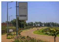
Completed Phase I infrastructure