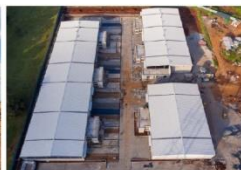
Africa Logistics Properties on track for opening this October