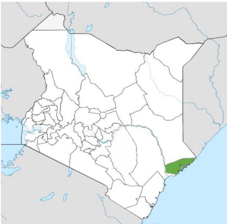
Map 1: Location of the County in Kenya